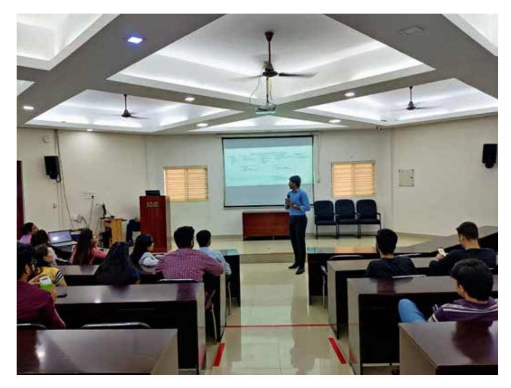
IIC and IEDC innovation-mentor session