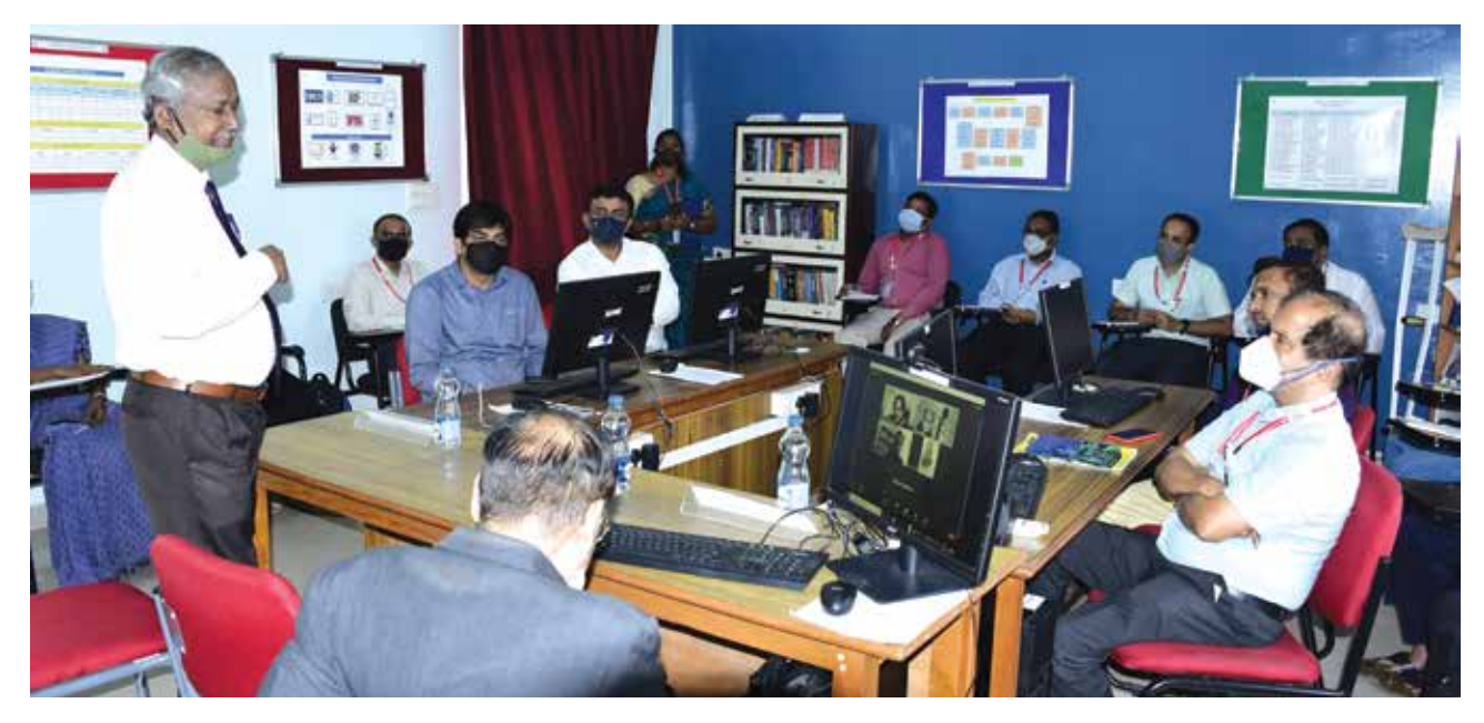
Snapshot of Scholars attending Ph.D coursework sessions

gets referred to by future generations of researchers for times to come. A total of 15 Scholars are attending the coursework which will continue till 11 Dec 2021.